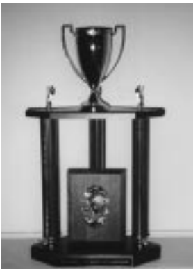
The Newell Award