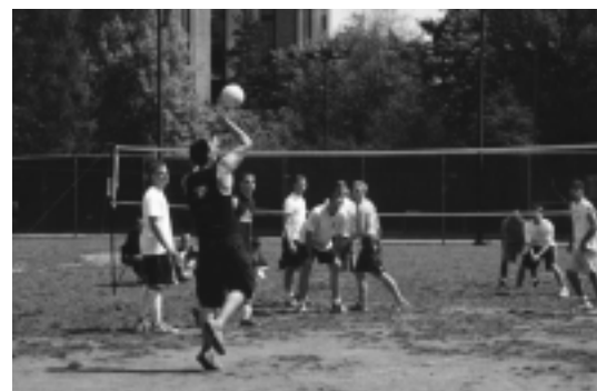
Pikes Championship Volleyball team at the Delta Delta Delta Spike Tournament

The culmination of the chapters year long athletic success came with the chapters 5 consecutive IMA championship.