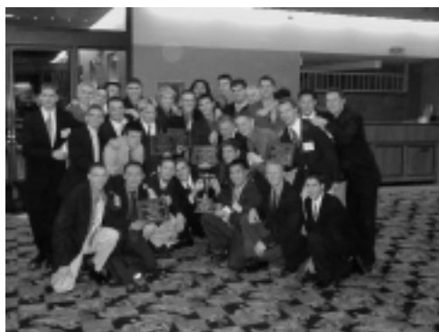
The brothers displaying some of the hardware they took home from the Regional Leadership Conference