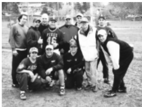
The Alumni Team poses for a victory photo after the game.

The annual Alumni Softball Game is never a thing of beauty. But this year's version brought the ugliness to new depths. The combination of a muddy field, beer in the alumni dugout, and horribly inept undergrads were the contributing factors in the alumni's stirring 12-10 victory.