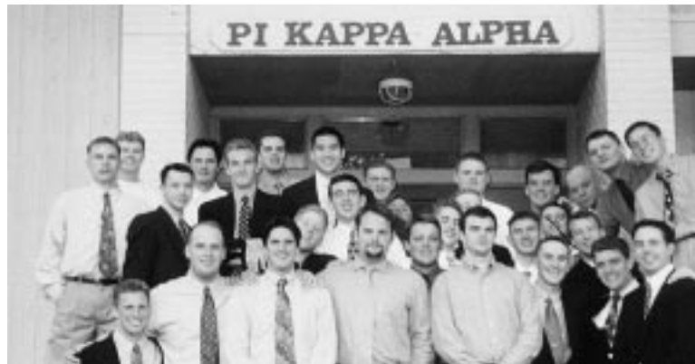
The brothers of Beta Beta at the end of the '97-98 school year.

Finally, Beta Beta won the 4 on 4 basketball tournament by soundly defeating WSU and took home a trophy and basketball signed by all the members of the Supreme Council. Overall, 1998 was another successful year for Beta Beta at the regional conference.