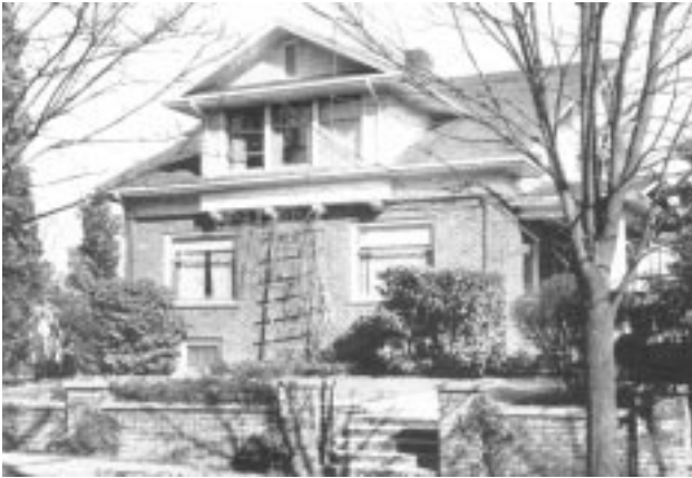
Pikes returned to campus after the war (1947-53, above) and soon moved to more spacious accommodations (1953-1970, right)