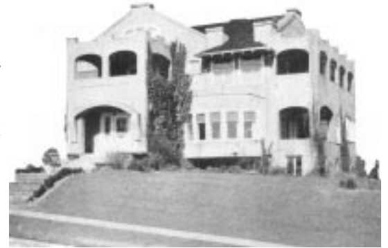
The second Pike chapter house (1920-1940)