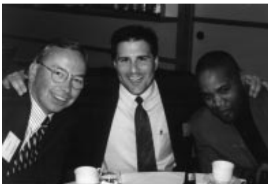
Founders' Day - our best yet! (see pages 4 & 5)